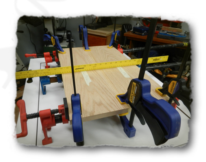
Waiting for the glue to dry on the edge glued blank for the Top (A).

Do the same to create a blank that will be used to form the Bottom (B).