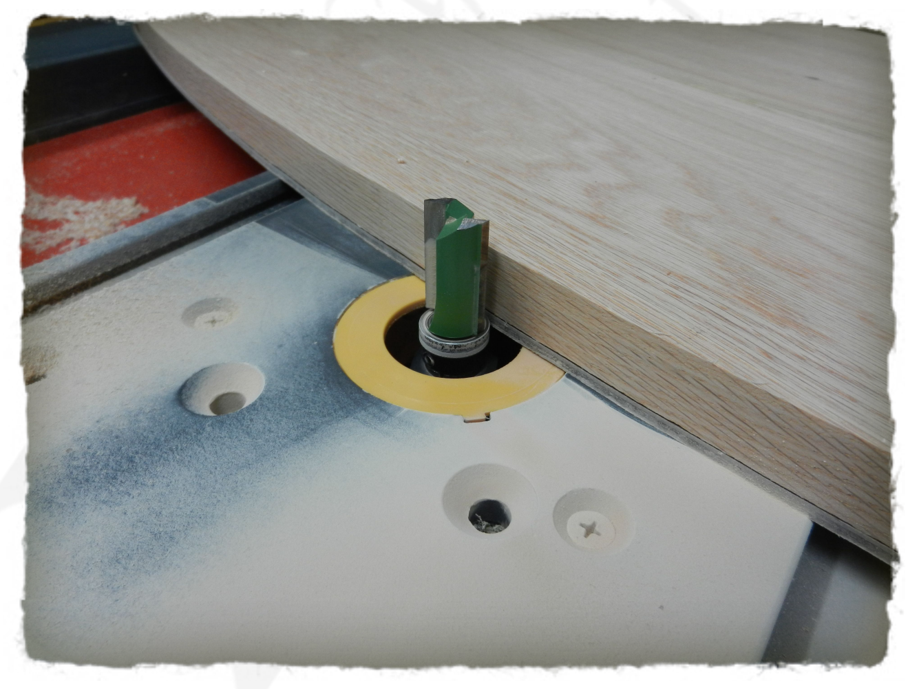
Using a template bit to cut the bow arc on the Shelf (E)

printed at any office supply store (such as Staples) that has the capability to print on ARCH-D (24" x 36") paper.